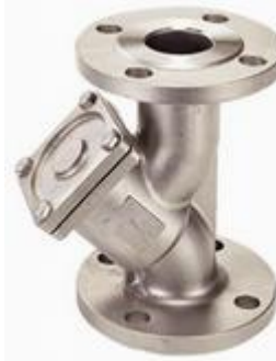
DJV-YS Bolted Bonnet, PTFE Gasket, S/S316 or S/S304 Screen Mesh Hole 0.8mm, 1.0mm, 1.2mm & 1.5mm Available