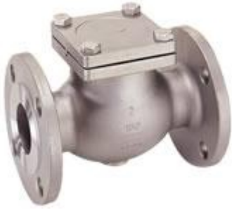
DJV-SC Bolted Cover, Swing Type Disc, Integral Seat Ring